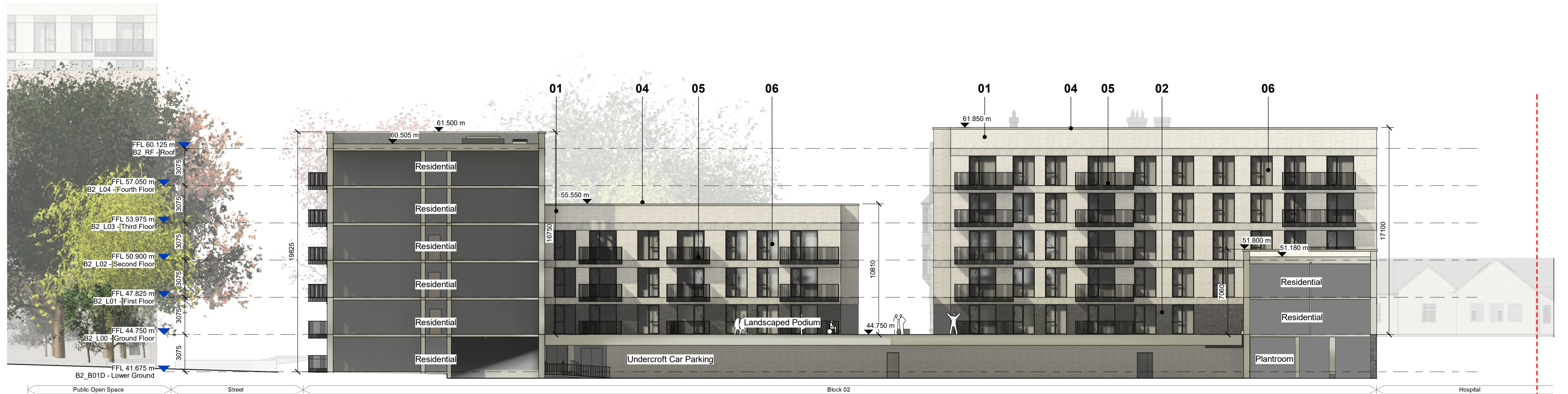
Section C-C 1 : 200

Notes: - Do not scale from this drawing. Use figured dimensions in all cases. - Verify dimensions on site and report any discrepancies to the Architect immediately. - This drawing is to be read in conjunction with the Architect's Specification. - © This drawing is copyright and may only be reproduced with the Architect's permission.